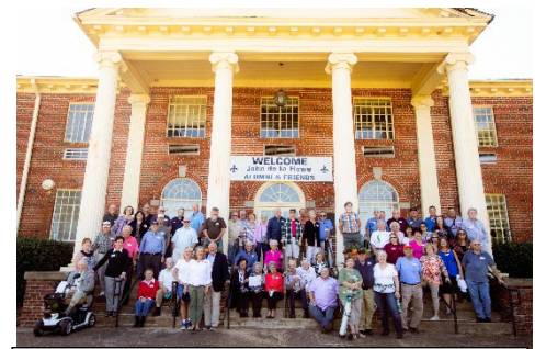
2018 Alumni Homecoming/Reunion picture

Alumni registration begins at 9 AM in the L.S. Brice School Building. Come visit with your friends, view the many photo albums in the library and reminisce about your days at de la Howe.