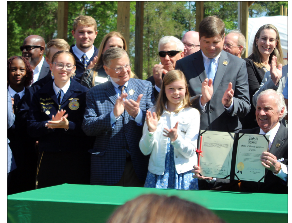
Our Aggies were front-and-center with other statewide dignitaries for this ceremony at Cottle Farms.