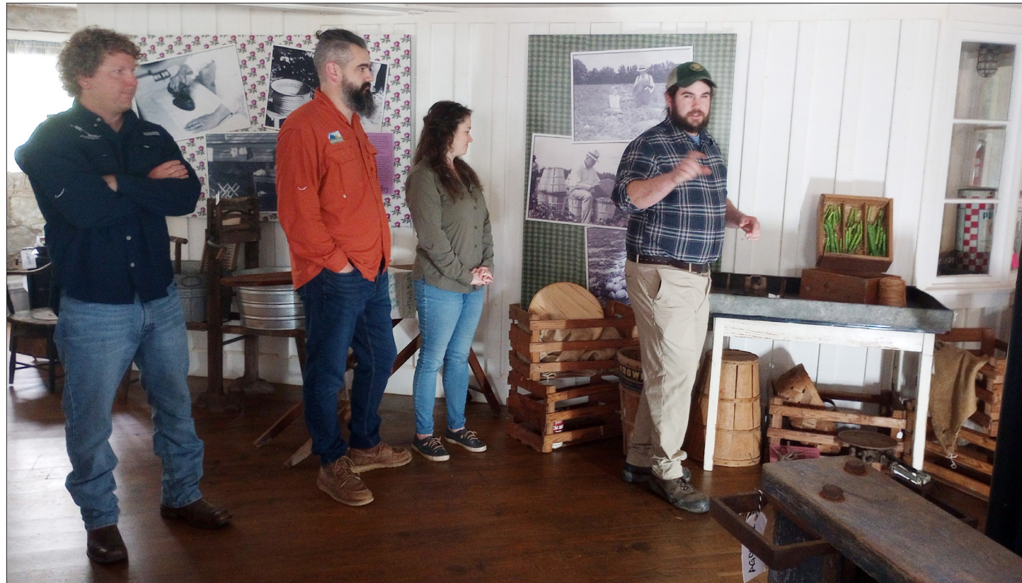
Staff members from the Bart Garrison Agricultural Museum of South Carolina at Pendleton recently visited our campus to train members of our staff on how to share the stories of items now on display at our iconic dairy barn. The museum will become an integral part of teaching agritourism and agribusiness here on campus.