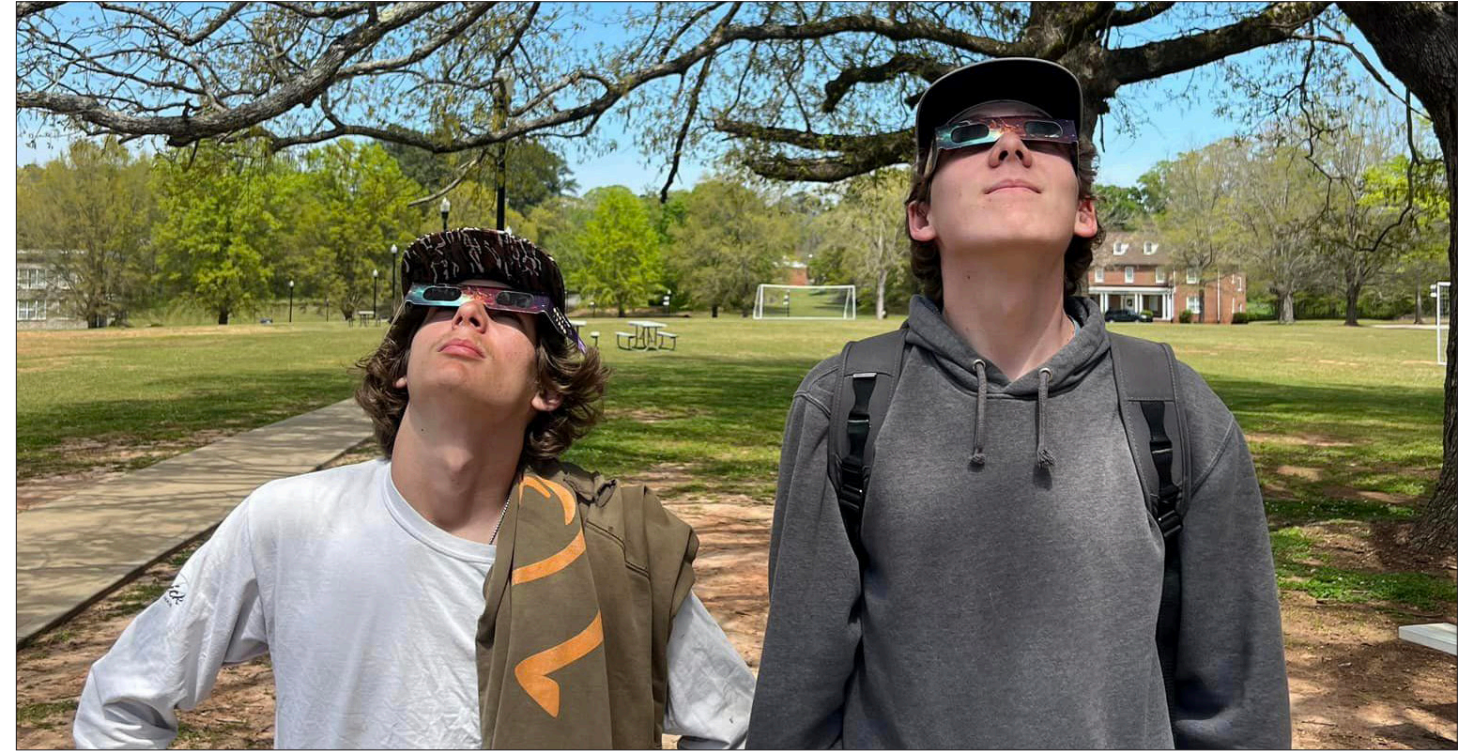
A group of Aggies gathered at the Governor's Green on Monday afternoon, April 8 to don their protective glasses and witness the partial solar eclipse -- the last such eclipse visible in South Carolina until March 2052.