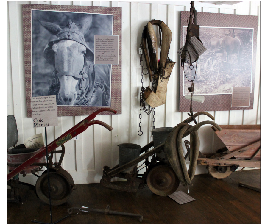
Among the artifacts on display are an old-timey meat-curing trough hewn from a log and a section on how mules and other beasts of burden were essential to early farming techniques.