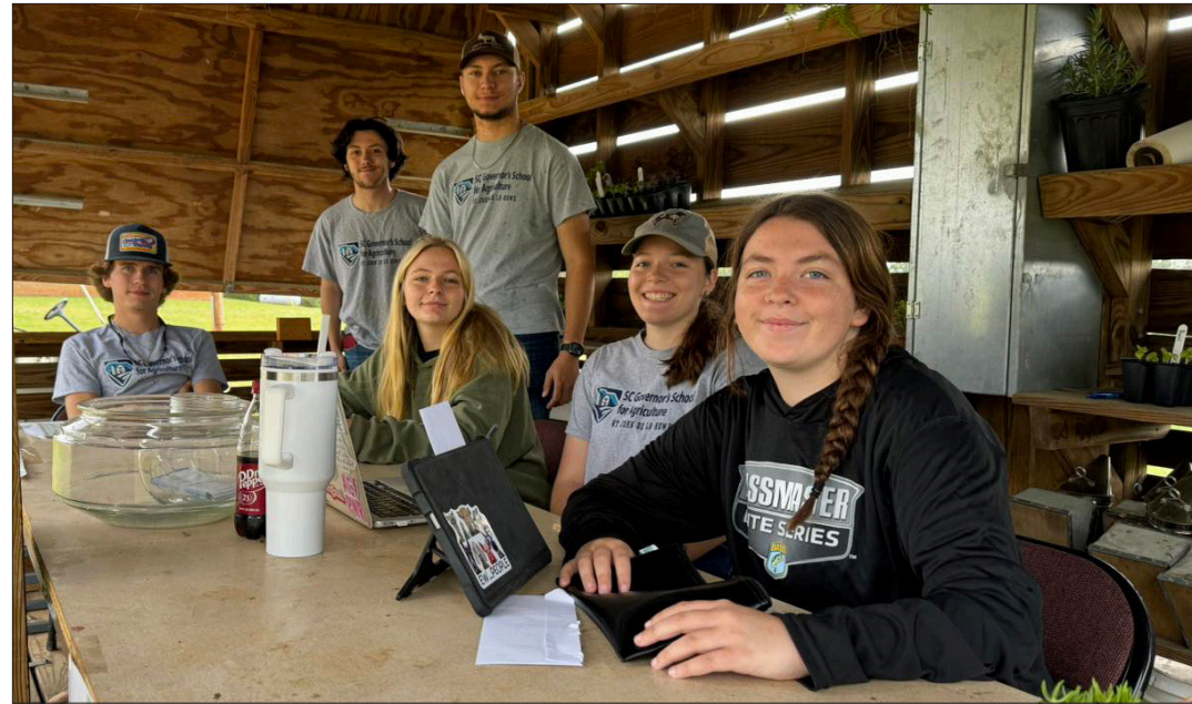
Teamwork among our horticulture students, members of the McCormick County Garden Club and parent and alumni volunteers created a successful climate for the Spring Plant Sale.