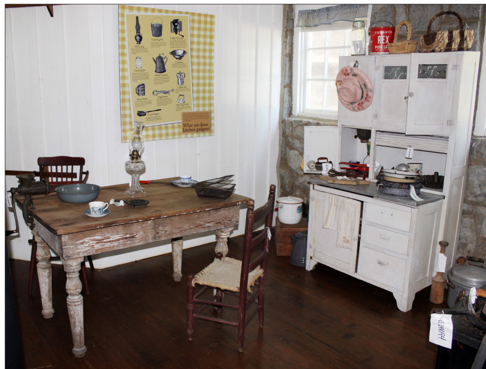
The dairy barn soon will open for exploring hundreds of artifacts, including this vintage kitchen diorama.

Last summer, a hard-working team of our maintenance and farm staff members relocated the items from Barnwell County. Volunteers from the Bart Garrison Agricultural Museum of South Carolina near Clemson traveled to our campus