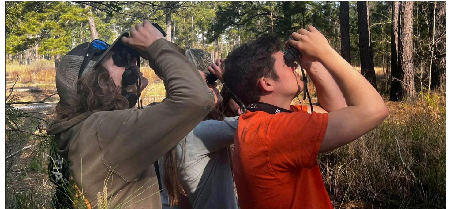
A delegation of Aggies attended a recent Wildlife Ecology / Outdoor Recreation Camp that included visits to the Congaree National Park, the Nemours Wildlife Foundation in Yemassee, Boone Hall Plantation near Charleston, and the Tom Yawkey Wildlife Center in Georgetown.