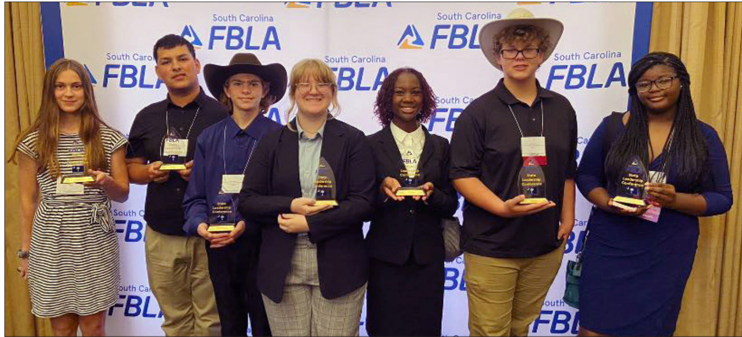
Seven of our Aggies collected awards at our chapter's very first South Carolina FBLA Leadership Conference in Myrtle Beach. It was a wildly successful debut!