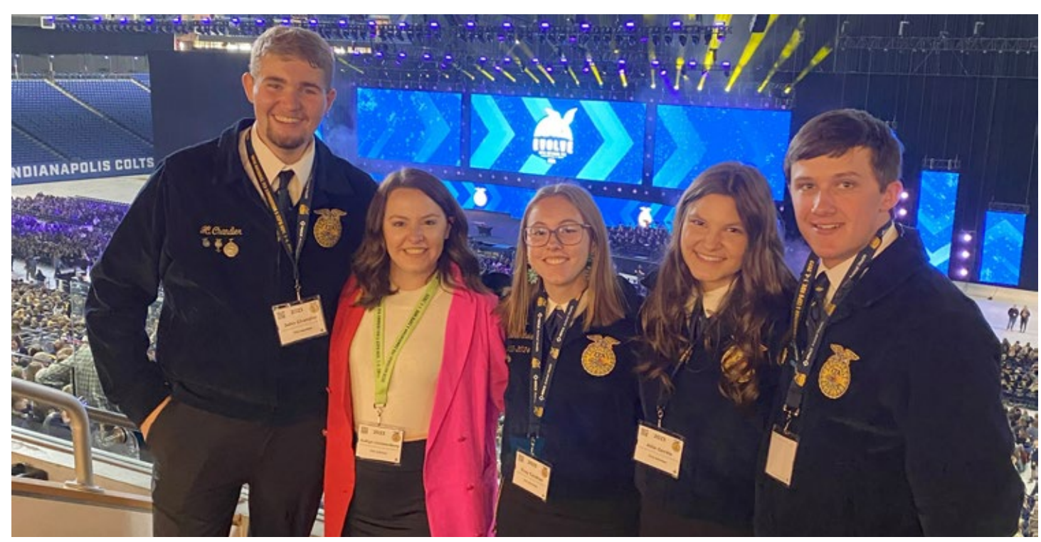
Members of our school's new Agriculture Communications team gather at Lucas Oil Stadium to celebrate their success in this new pilot program for South Carolina.