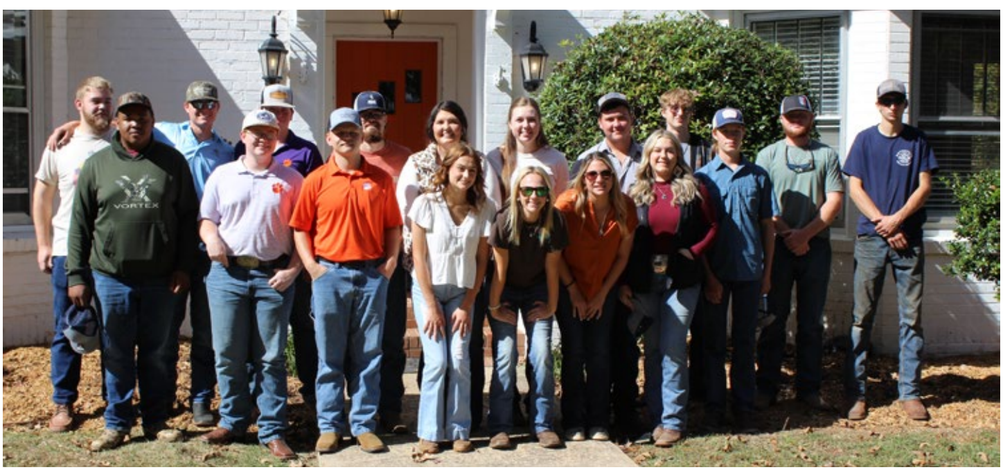
Graduates from the first two classes to finish the new Governor's School for Agriculture mission gathered for a photo opportunity in front of the President's House.