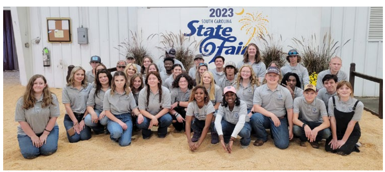
A large contingent of Aggies traveled to Columbia in mid-October to take part in the annual FFA Day at the South Carolina State Fairgrounds.

Spring Heifer Calf – 2nd place in open show, 1st place in junior show, Grand Champion in junior show; (b) Holstein Winter Heifer Calf – 1st place in both open and junior show, honorable mention in open show, Grand Champion in junior show; (c) Senior Two-Year-Old – 1st place in both open and junior show, Grand Champion in both open and junior show; (d) Brown Swiss Spring Heifer Calf – 1st place in both open and junior show, Grand Champion in both open and junior show; (e) Winter Yearling Heifer – 2nd place in open show, 1st place in junior show; (f) Senior Two-Year-Old Cow – 1st place in both open and junior, Grand Champion in both open and junior; and (g) Four-Year-Old Cow – 1st place in both open and junior, Reserve champion in both open and junior, 1st place in best three females with